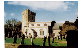
St Mary's Church, Meare