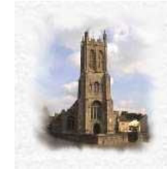
St Benedict's Church