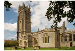
St John's Church