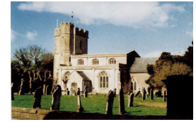
St Mary's Church, Meare