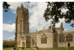
St John's Church