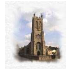
St Benedict's Church