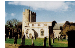
St Mary's Church, Meare